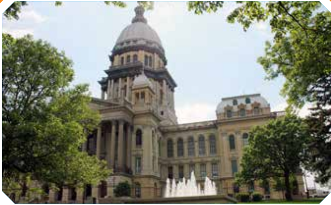
The capital of Illinois is Springfield