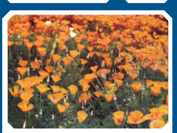
The California golden poppy is the official state flower of California.