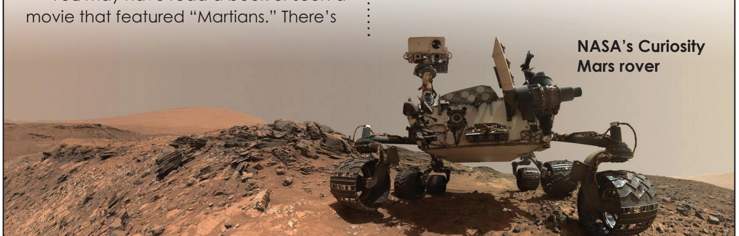
NASA's Curiosity Mars rover

While rovers roam the planet every day, no person has ever set foot on Mars. NASA has made plans for a manned mission to take place decades from now. Perhaps then we’ll learn the truth of whether there was once life on a planet besides Earth.