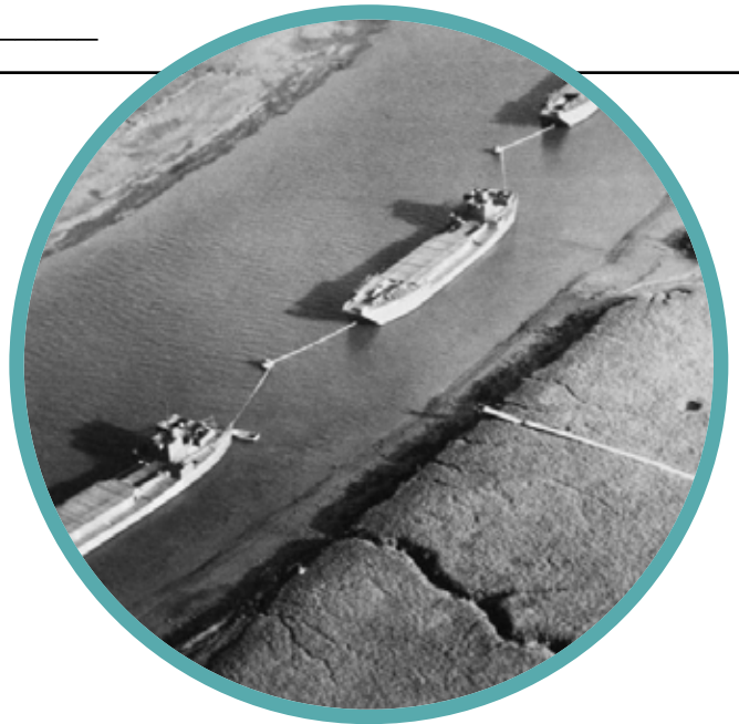
dummy landing craft used as decoys in southeastern U.K. harbors

continued to fight, with few successes. In the end, France and the rest of Europe were liberated. World War II ended on May 8, 1945.