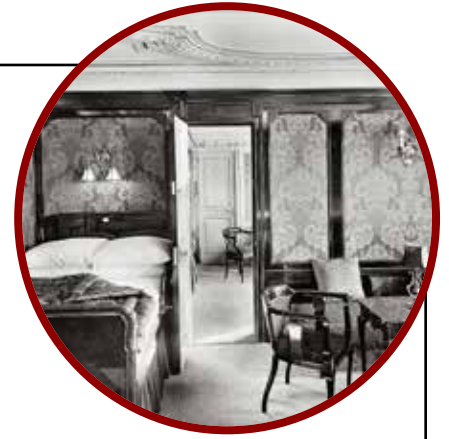
Titanic's first class stateroom

Fill in the missing letters to make a vocabulary word from the article. Then write the full word on the line. Be sure you spell each word correctly.