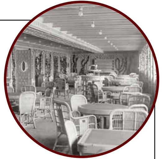
Cafe Parisien on the Titanic