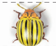
Potato Beetle: _____