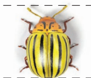
Potato Beetle: 2 cm or 20 mm