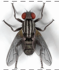
Fly: 3 cm or 30 mm