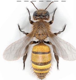
Honeybee: 4 cm or 40mm