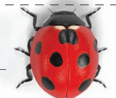
Ladybug: 1 inch