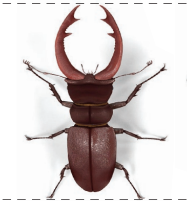
Stag Beetle: _____

Use a ruler to measure the height of each insect to the nearest inch.