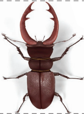
Stag Beetle: 2 inches

Important note: Answers will vary depending on your computer's printer settings. Measurements may not be the same as the answers below.