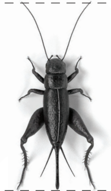
Cricket: 2 inches