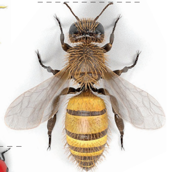
Honeybee: 3 inches