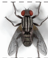
Fly: 1 inch