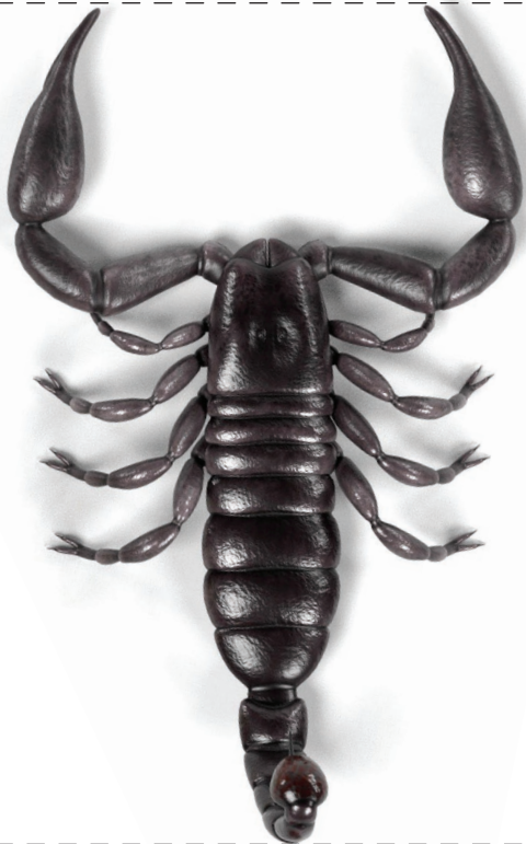
Scorpion: 4 inches