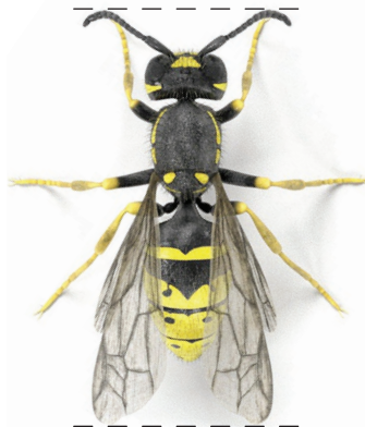
Yellowjacket: 2 inches