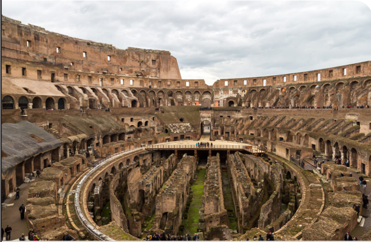
A view of the interior of the Colosseum.

The Colosseum had much more than gladiator fights. There were staged hunts of wild animals from around the world. There were plays and shows. For the first few years, they even flooded the arena for swimming