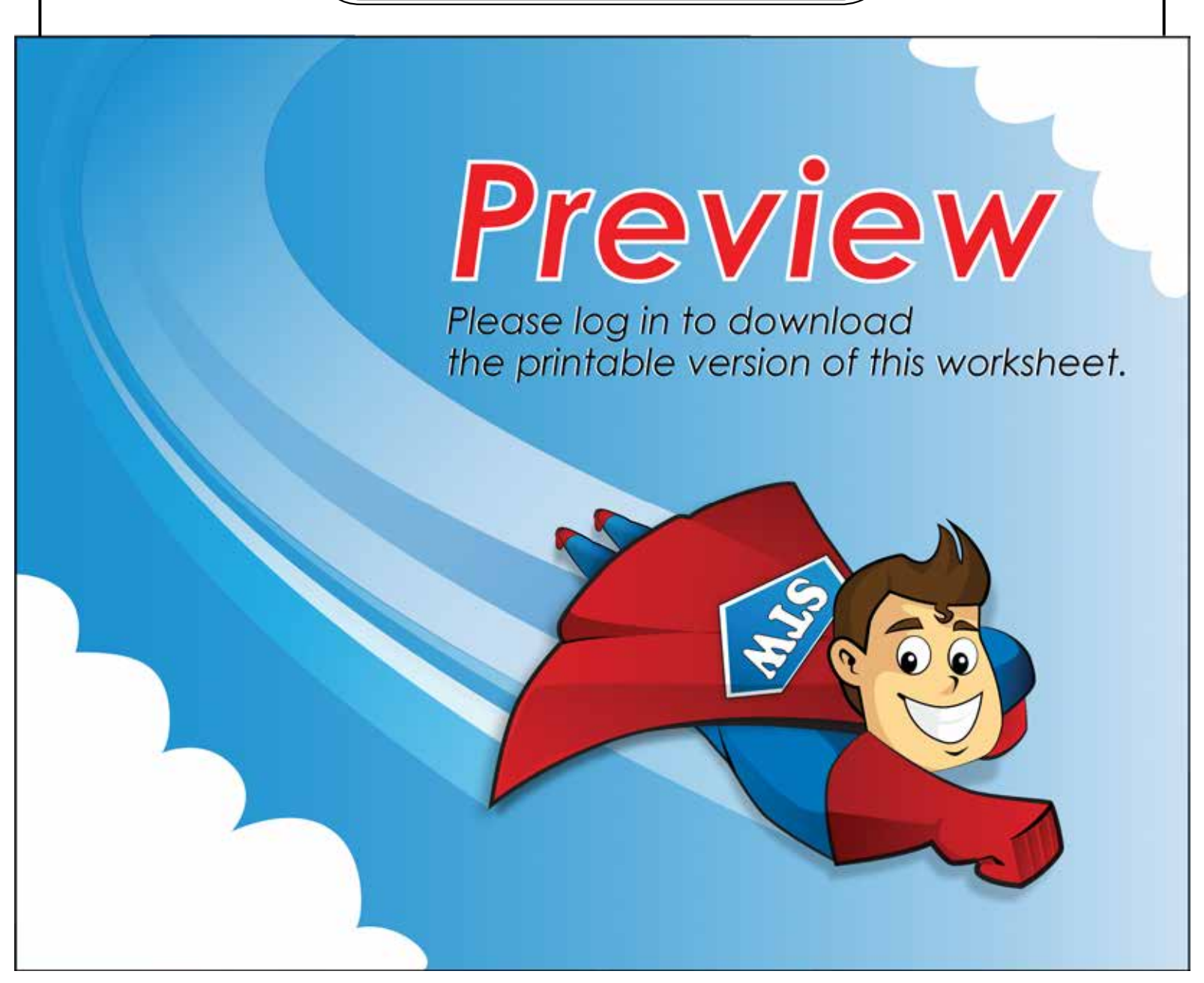
Super Teacher Worksheets - www.superteacherworksheets.com