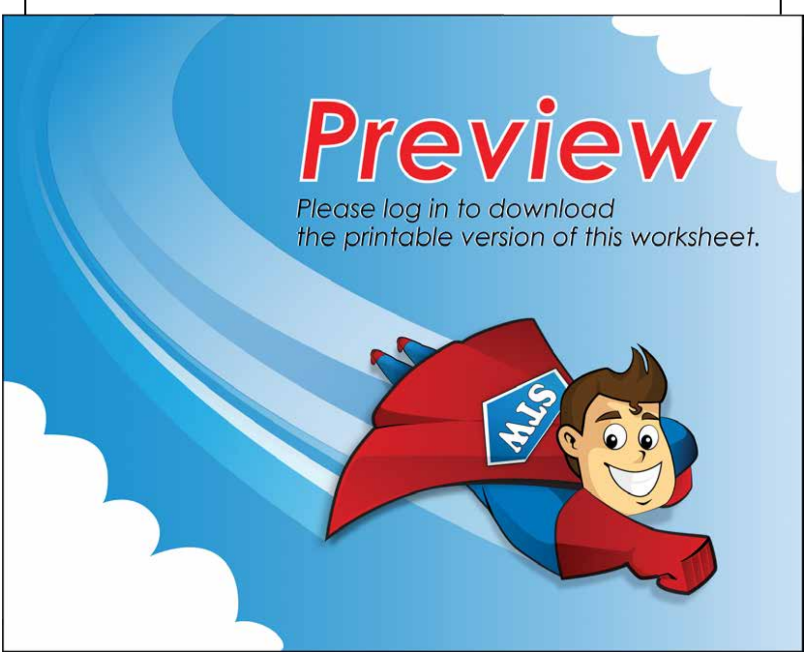
Super Teacher Worksheets - www.superteacherworksheets.com