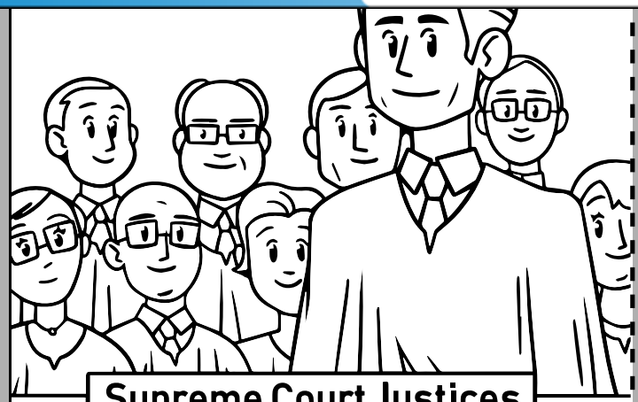
Supreme Court Justices

Please log in to download the printable version of this worksheet.