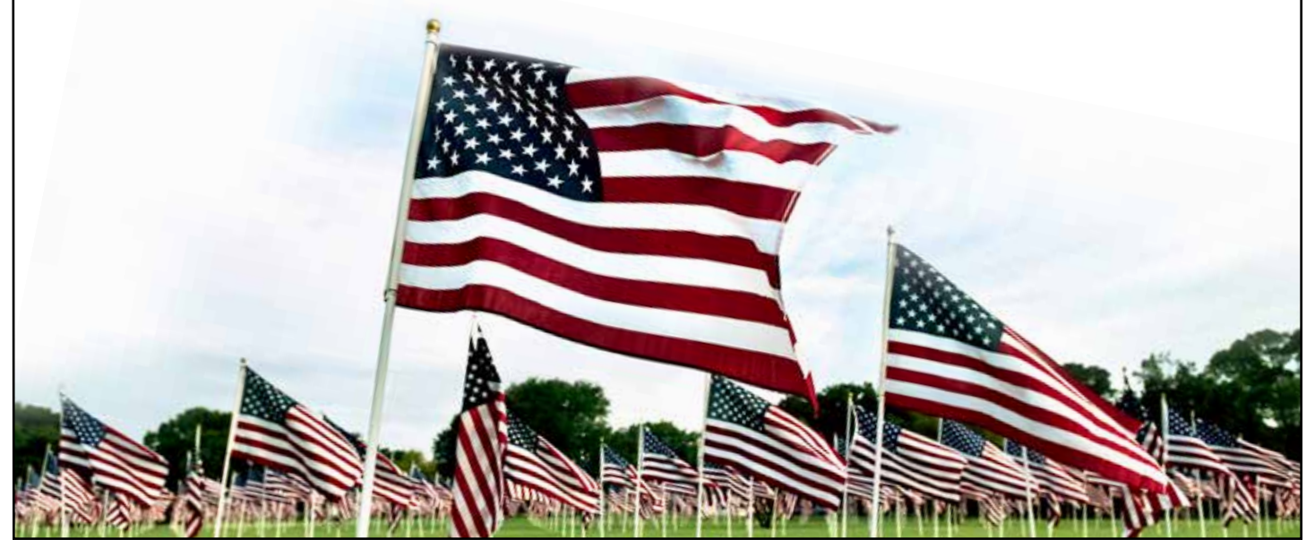
Super Teacher Worksheets - www.superteacherworksheets.com

In other pans of the world, November 11 is still celebrated as Armistice Day of Remembrance Day because it marks the anniversary of the signing of the Armistice that ended World War I. But whether you call it Veterans Day, Remembrance Day, or Armistice Day, November 11 is a time to honor all those who served in the military.