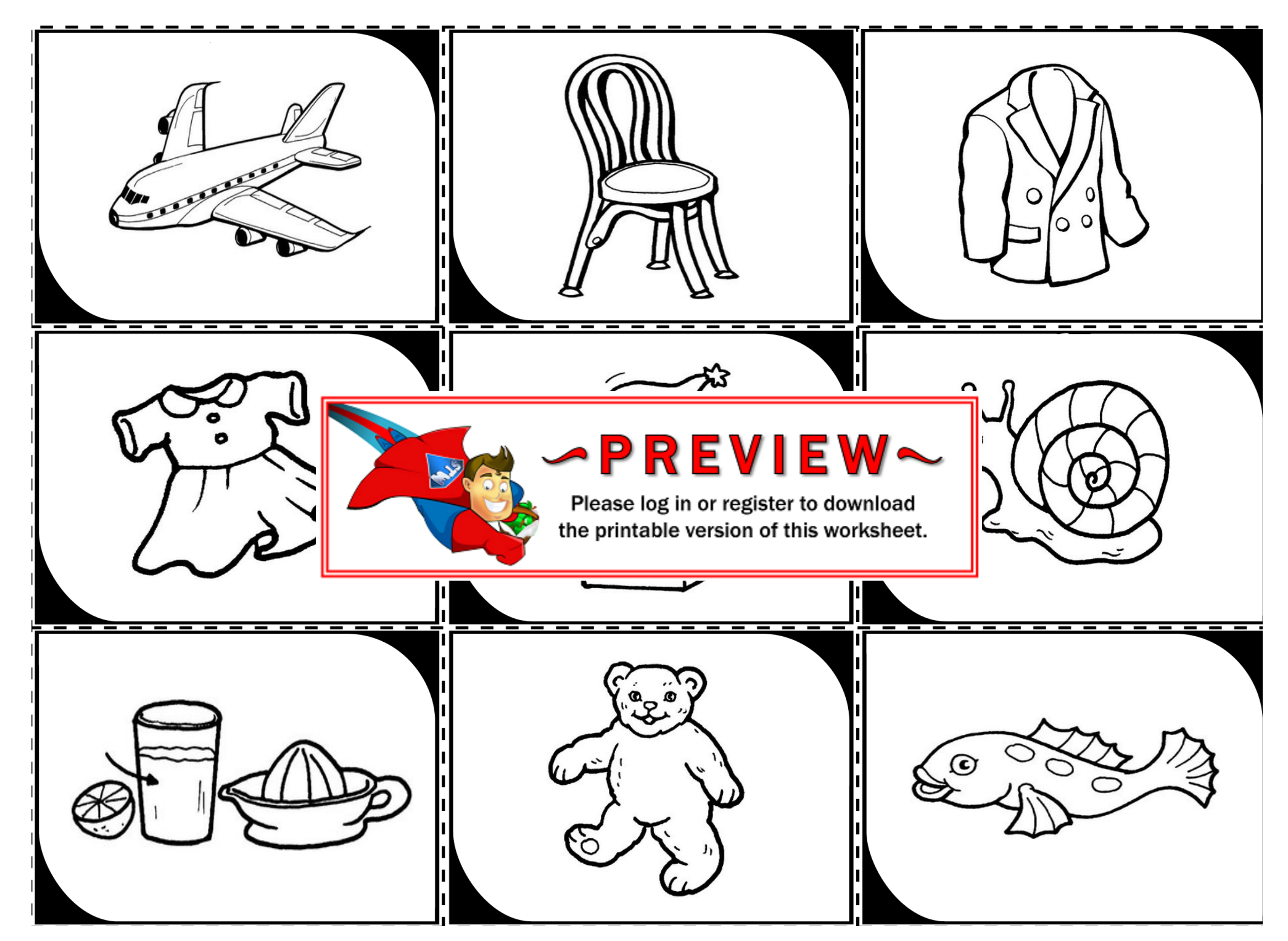
Super Teacher Worksheets - <u>www.superteacherworksheets.com</u>