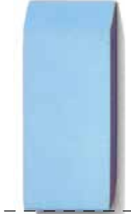
Eraser: 4 cm