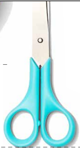
Scissors: 11 cm